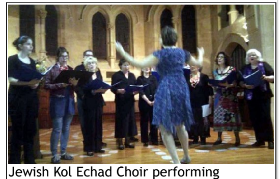
Jewish Kol Echad Choir performing