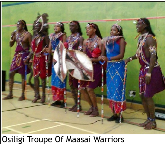
Osiligi Troupe Of Maasai Warriors