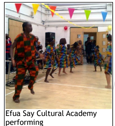
Efua Say Cultural Academy performing